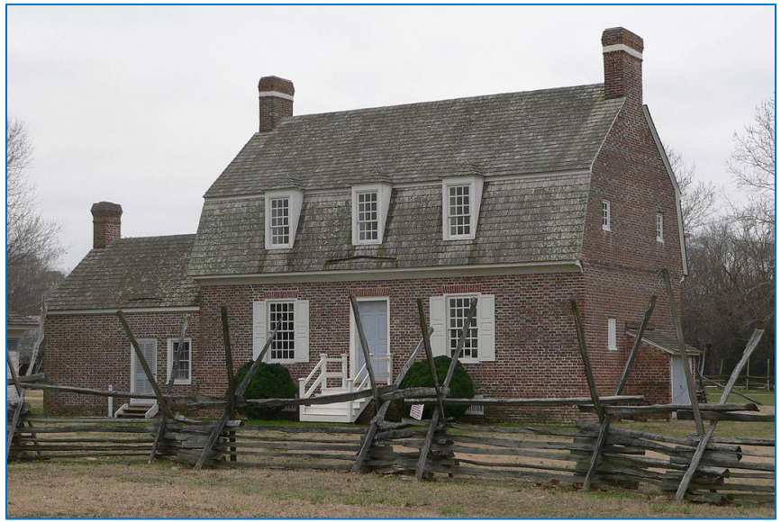
Pemberton Hall - See page 6

The purpose and objectives of the Society shall be: To enrich knowledge of American history and the development of America through the efforts of indentured service. To preserve the history of indentured servitude through (1) conservation of historical documents, (2) publication and/or abstracting of primary source materials, (3) partnering with organizations to further public awareness and acknowledge the contributions of our immigrant indentured servant ancestors, who brought their talents, skills, and labor to the colonies to help make their new-found country a success.